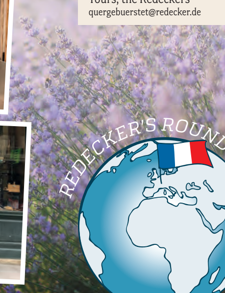
Yours, the Redeckers