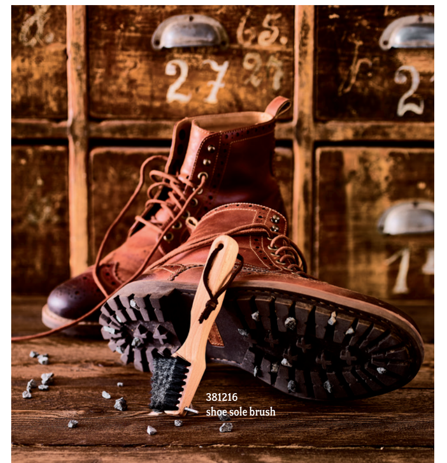
Yours, Gernot Redecker