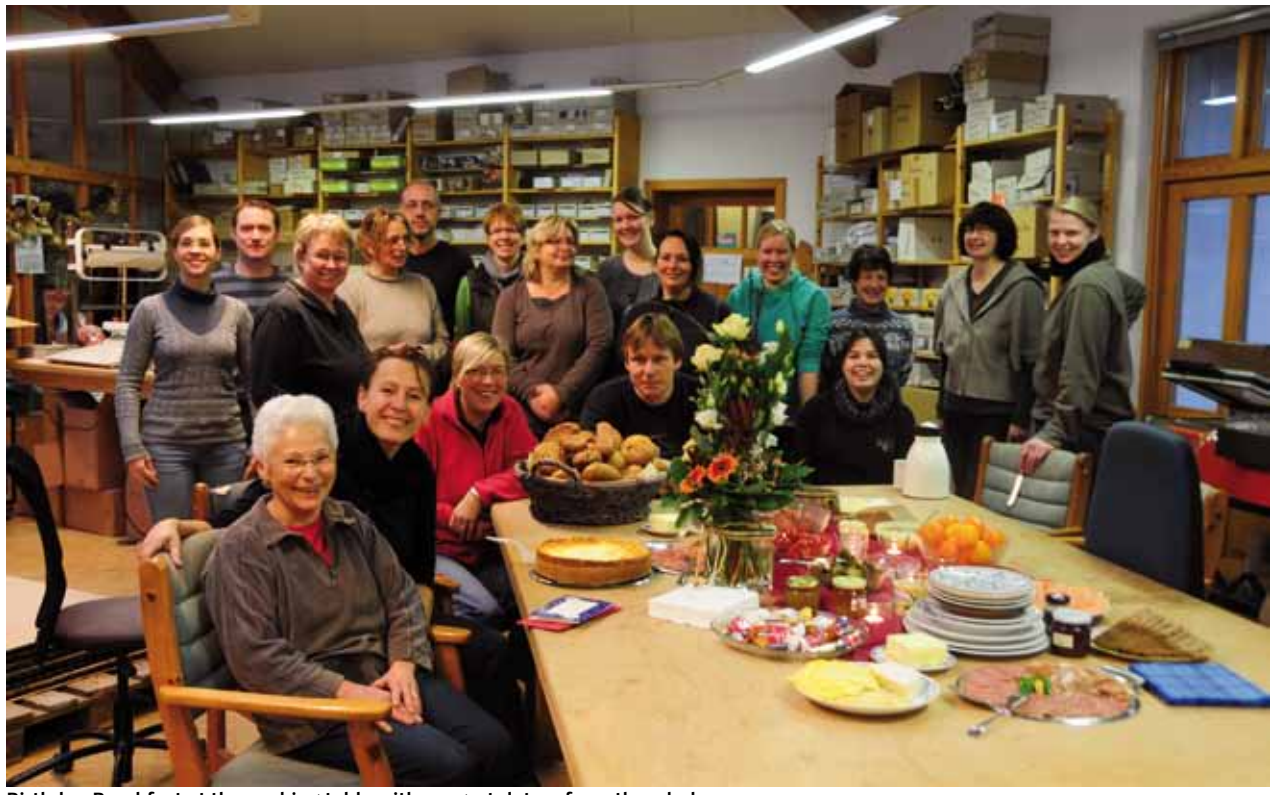
Birthday-Breakfast at the packing table with congratulators from the whole company