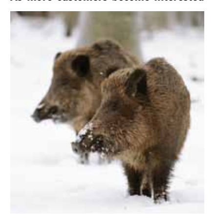
Wild and shaggy: the longest natural bristles come from wild boars

in our products, we also have to answer more questions. We are especially pleased to answer specific questions related to individual products. You are already familiar with our "Redecker references" as useful tools. Now you will find answers to the most frequently asked questions below.