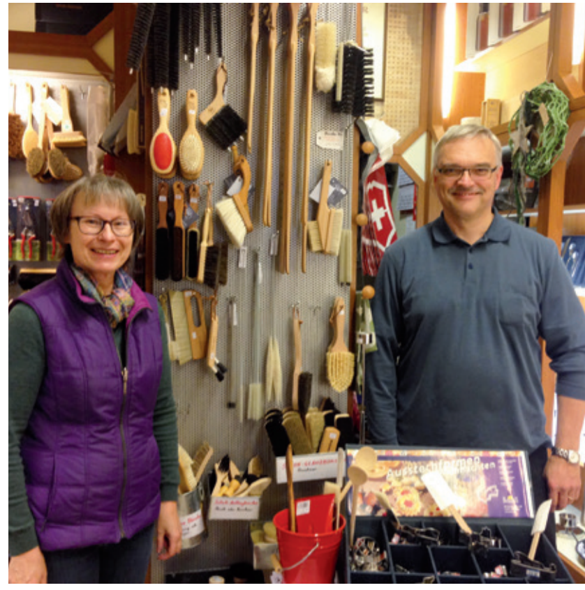
Family Preuss midst of their Redecker product range.

switched its focus: We got to know one another during a visit to our stand at the "Ambiente" in Frankfurt; they started to think about brushes and household products and placed an initial trial order.