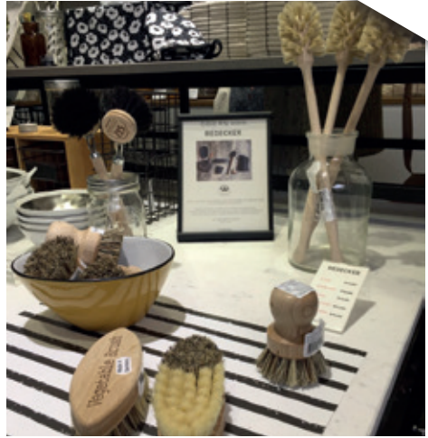
More impressions of our trip to Seoul ...